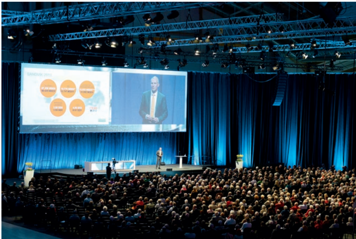
Well-attended Annual General Meeting on 13 May 2014 at the Göransson Arena in Sandviken, Sweden.

example, the Annual Report, dividends, election of the Board and, where applicable, appointment of auditor, and other matters stipulated in the Companies Act, the Articles of Association and, where applicable, the Code.